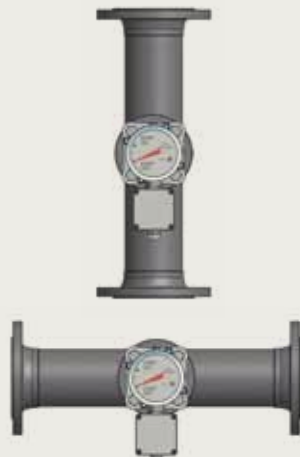
Installation positions MFloC® indicator unit